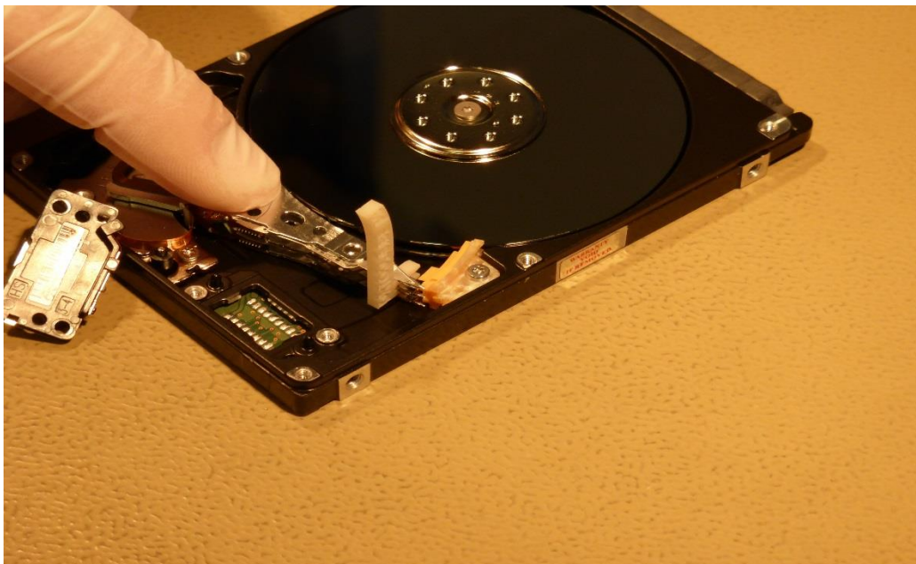
Be Careful while inserting them back again onto the ramp, watch carefully that they fit properly into each ramp slide.